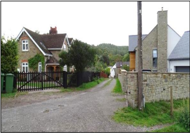
Crown Lane showing older house on left and modern build on right