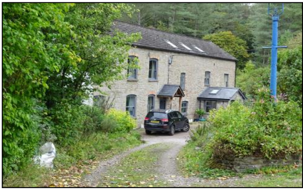
Castlemain Mill formally offices of the Deep Navigation Coal Company