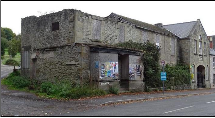
Mrs Sheward's Shop – now derelict following an inheritance dispute for over 40 years