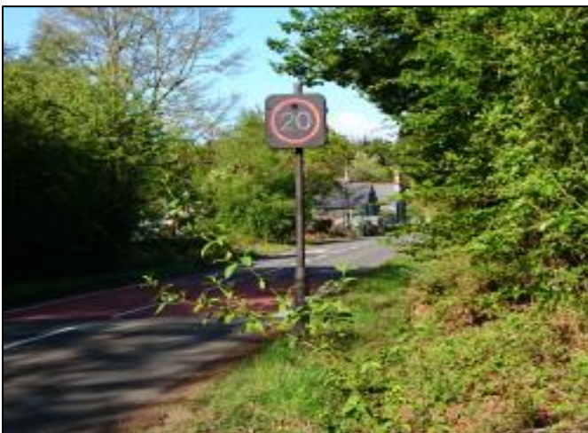
From Yorkley just before Parkend School