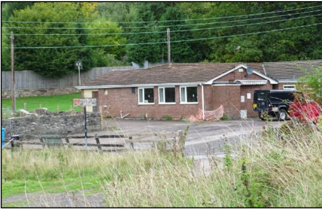
Working Men's Club with camping and caravan ground

Active transport: There is a network of recognised footpaths throughout the forest. The Parkend extension of the Family Cycle Trail continues to Coleford.