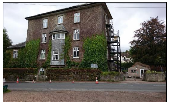
Dean Field Studies Centre formally the Engine House and then the Forestry School before being bought by Bristol City Council for residential use by schools.

St Paul's Church and The Old Vicarage were both built in an unusual octagonal design around 1900.