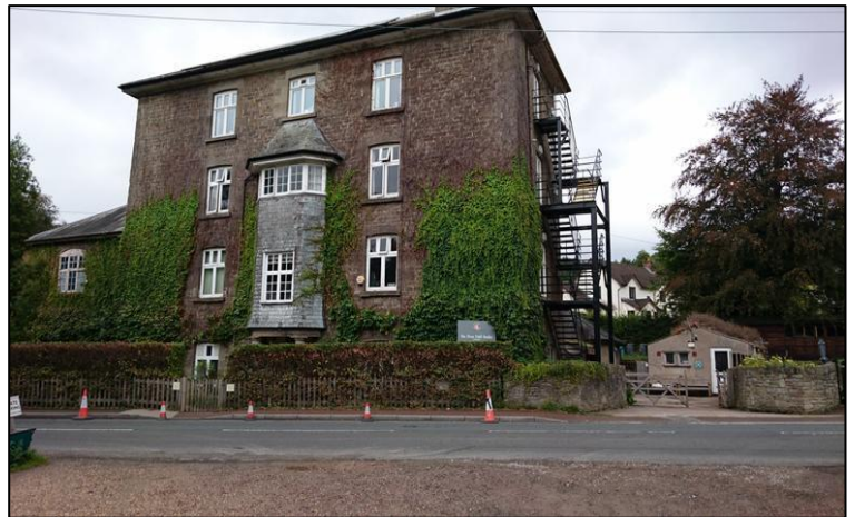
Dean Field Study Centre