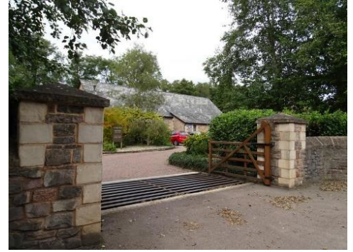
Kingdom Hall – modern build using traditional materials

Parkend Cricket Club (teams from 8 years+) play on the sports field