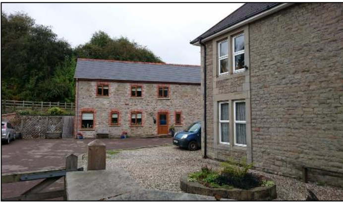
The Foundry – converted stone buildings