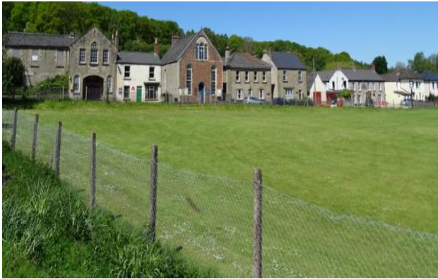
Folly Road and the sports field

Most of the buildings are built along the main roads though the village.