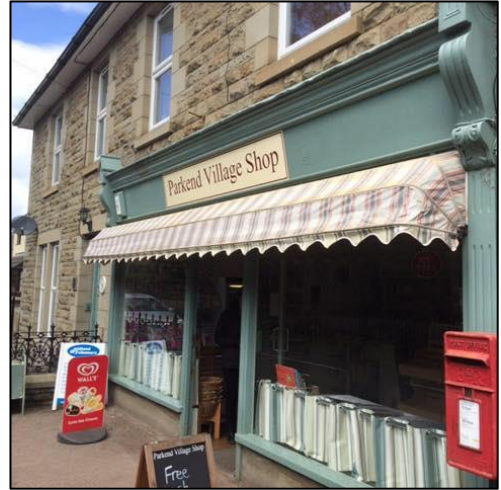
Parkend Village Shop with Post Office and Postage Stamp cafe