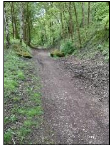
Walking/cycling trails throughout the forest