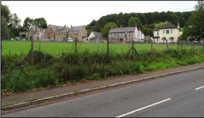
Sports field / Folly Rd from New Rd

Buildings and Historic items of note, the evidence of an historic past linked to Forest culture, include: