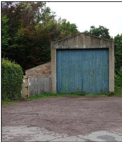
Forestry England's 'Giraffe House'