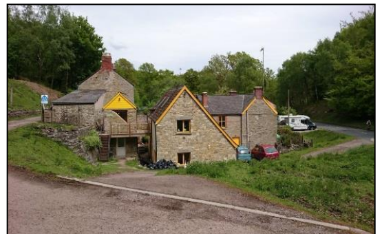
Mary Rose Pottery

There are several small businesses run from home.