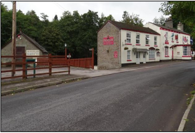
Fountain Inn – the oldest building in the village