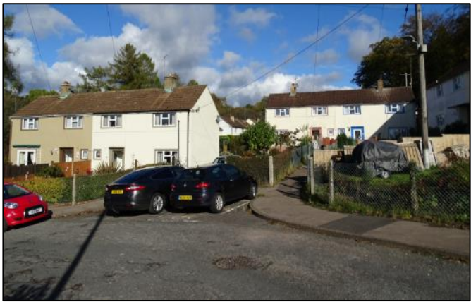
Social housing and ex-council houses