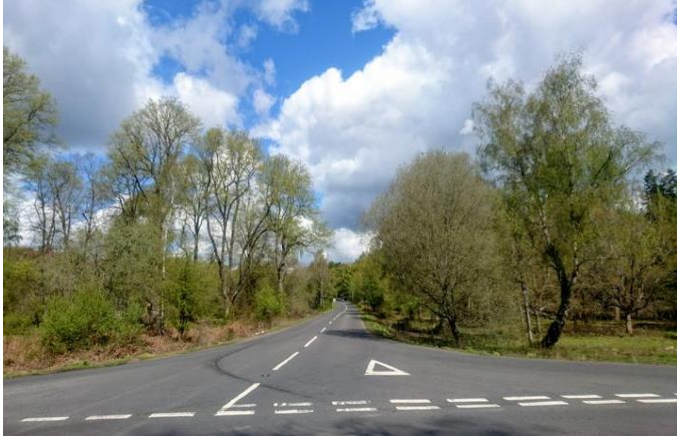
T Junction from Speech House to turnoff for The Barracks