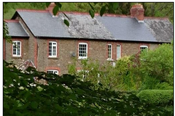
The Barracks – from road