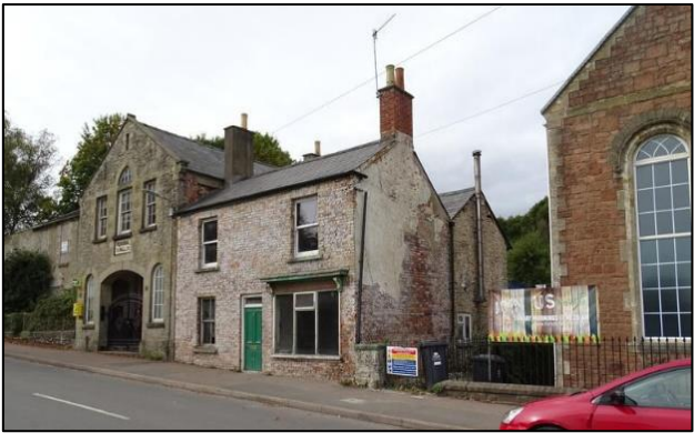
Memorial Hall, Old Post Office & Baptist Church