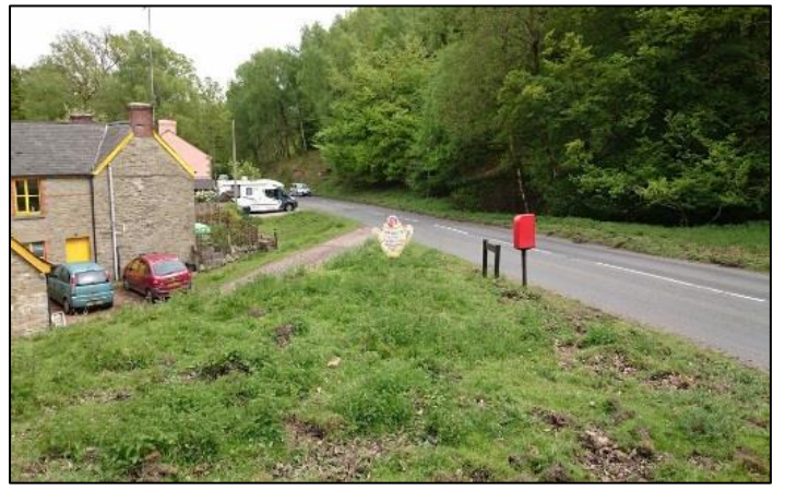
From Coleford past The Folly