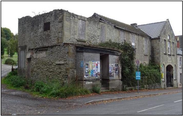
Derelict building previously a shop on the corner of Hughes Terrace – subject to an inheritance dispute