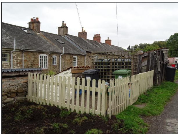
Hughes Terrace – workers cottages, many now converted to holiday lets