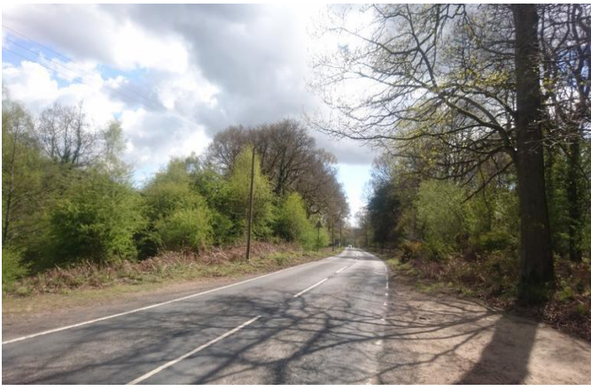
From Speech House (Blakeney Rd)