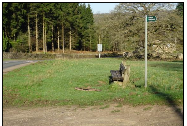
From Yorkley towards the village