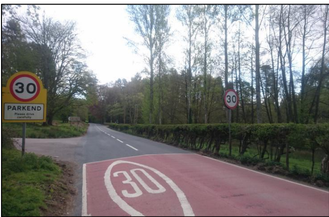
From Coleford- RSPB Nagshead (L) and Whitemead Park (R)