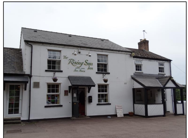
Rising Sun at Moseley Green