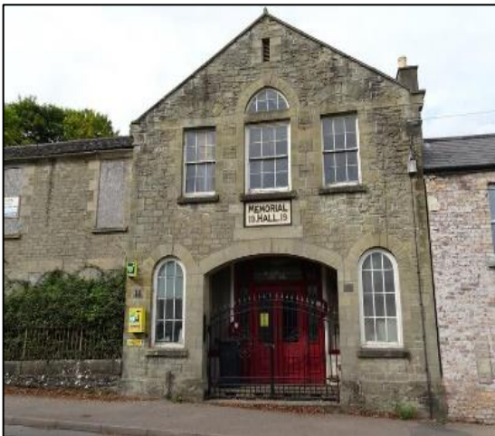
Parkend Memorial Hall

Buildings and Historic items of note, the evidence of an historic past linked to Forest culture, include: