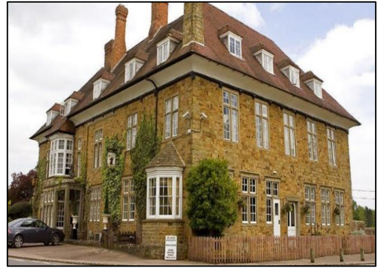
Speech House - home to the Verderer's Court