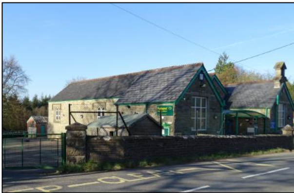
School viewed from School House

There are a wide range of building styles from old stone cottages to modern houses, older and modern industrial units and everything in between.