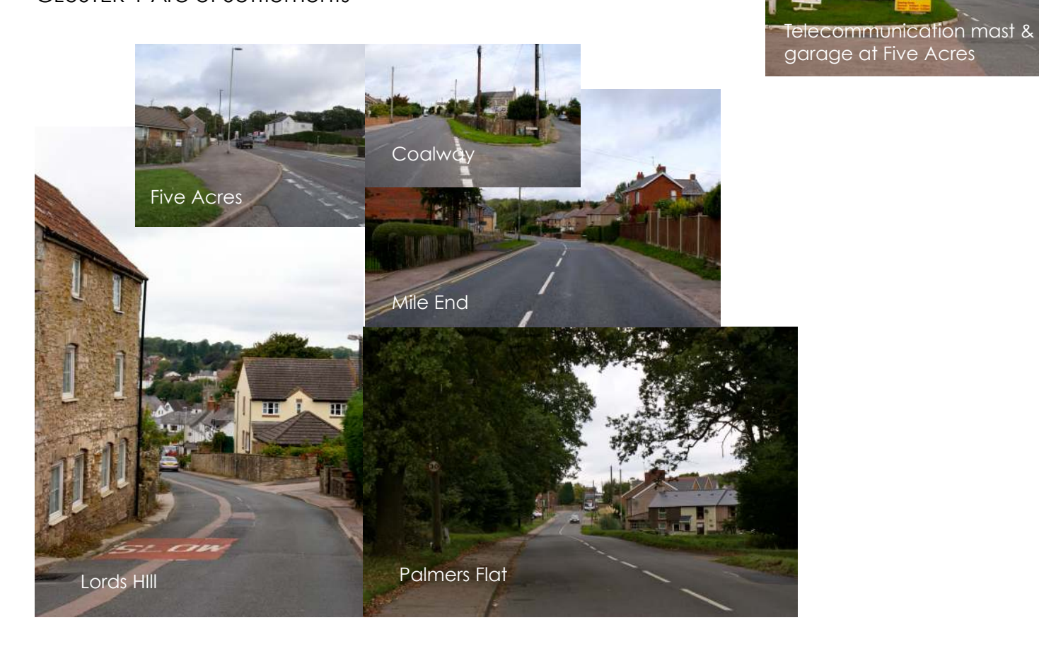
CLUSTER 2 Settlement Fringe