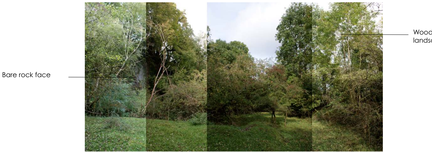
Panorama 10 taken near Whitecliff from the track running parallel to Newland Road illustrates the steep wooded valley