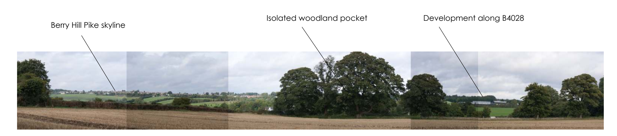
Panorama 4 taken from the footpath south of Lords Hill illustrates the woodland pockets