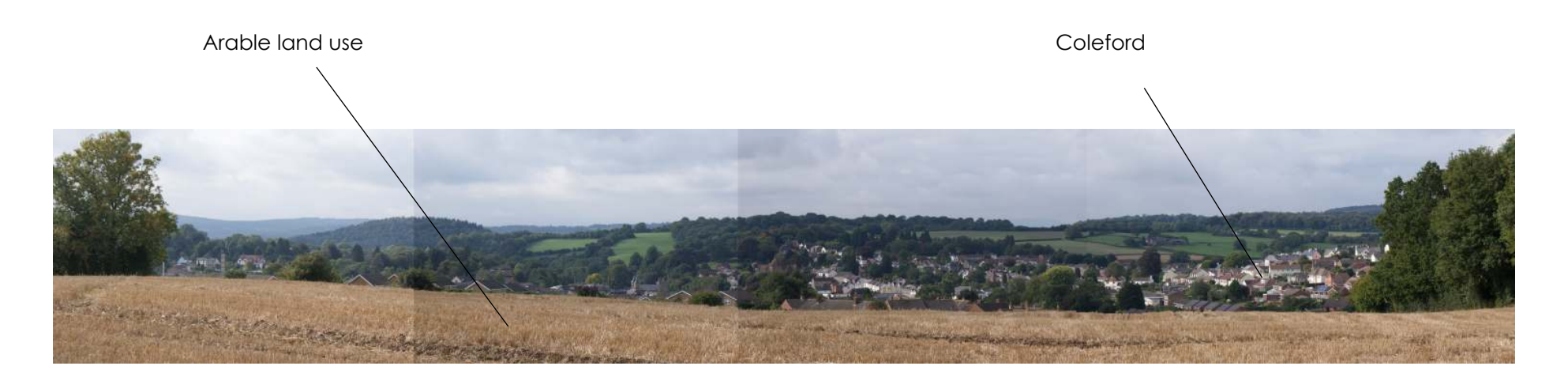
Panorama 3 taken from the footpath south of Lords Hill illustrates arable land use