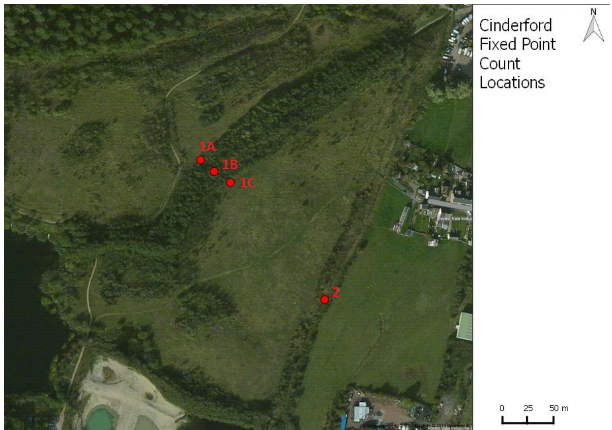
Plan 1 – showing locations of all fixed point counts.

2.1.4 The second crossing point is along Old Engine Brook which is a much narrower vegetation strip along an old brook, this narrows to 10m wide close to the new road crossing point and can therefore be fully surveyed by one surveyor (2 – See plan 1).