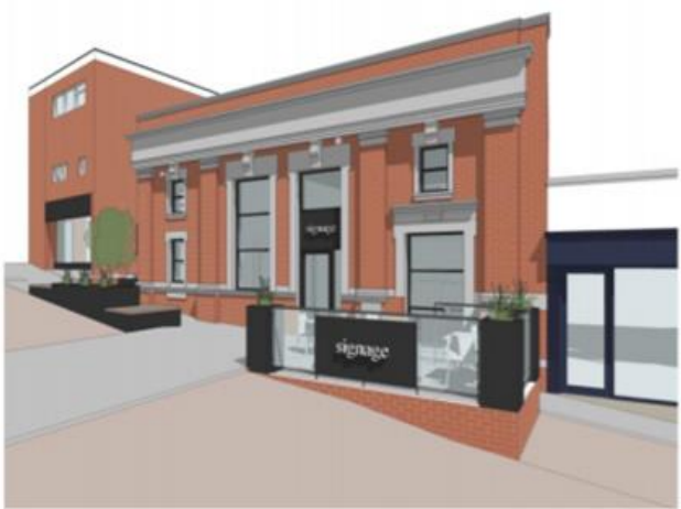
Proposed Street Scene

Change of use planning application drawings